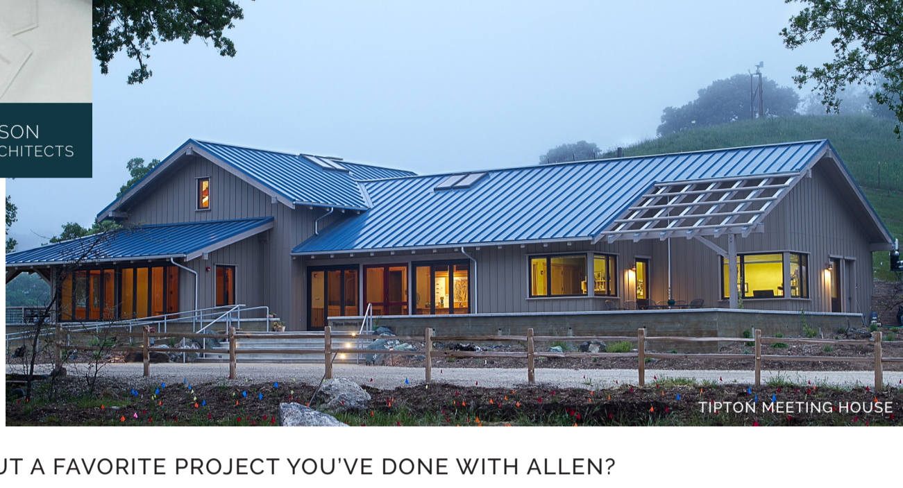
TIPTON MEETING HOUSE