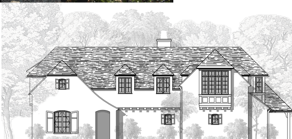
FRENCH COUNTRY HILLTOP HOME

The second project to begin construction will be a beautiful French Country Hilltop Home designed by acclaimed architects and longtime friends of Allen Construction, Becker, Henson, Niksto. This 3,000 sq. ft. home will feature a pitched slate roof, Kolbe French Doors, and open living spaces capitalizing that will capitalize on the amazing views from the top of the hill in the Ondulando neighborhood.